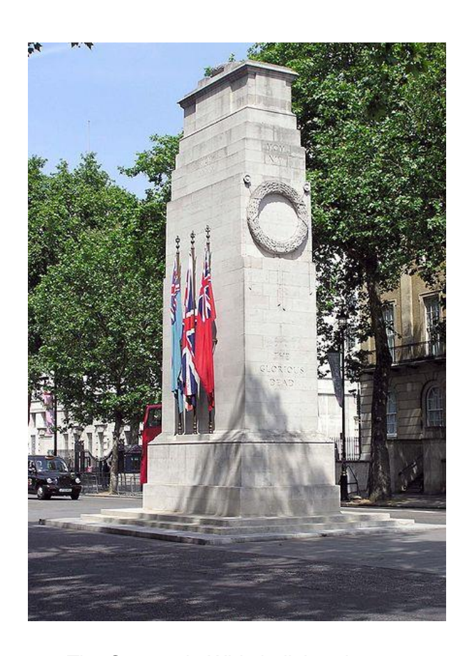
The Cenotaph, Whitehall, London . 1925