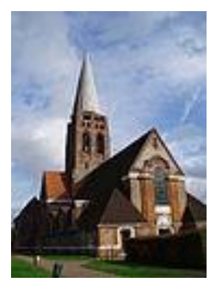
Free Church, Hampstead Garden Suburb