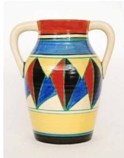
A Clarice Cliff jug