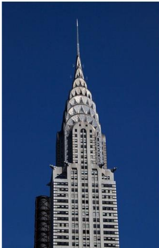
The Chrysler Building, New York

Art Deco swept across Europe and America in the 1920's, bringing with it a transformation in design. From brightly coloured, geometric patterns on fabrics, wallpapers and in book illustration to the soaring, elegant lines of New York skyscrapers. Art Deco helped to introduce Modernism to a mass audience. Fashion design too was affected by the new style, bringing with it beaded flapper 'dresses, fabulous handbags and bias cut dresses. Hollywood was quick to reflect the new style, perhaps best epitomised in the films of Fred Astaire and Ginger Rogers. This lecture gives an overview of Art Deco style and design and also looks at the legacy of the movement's legacy today.