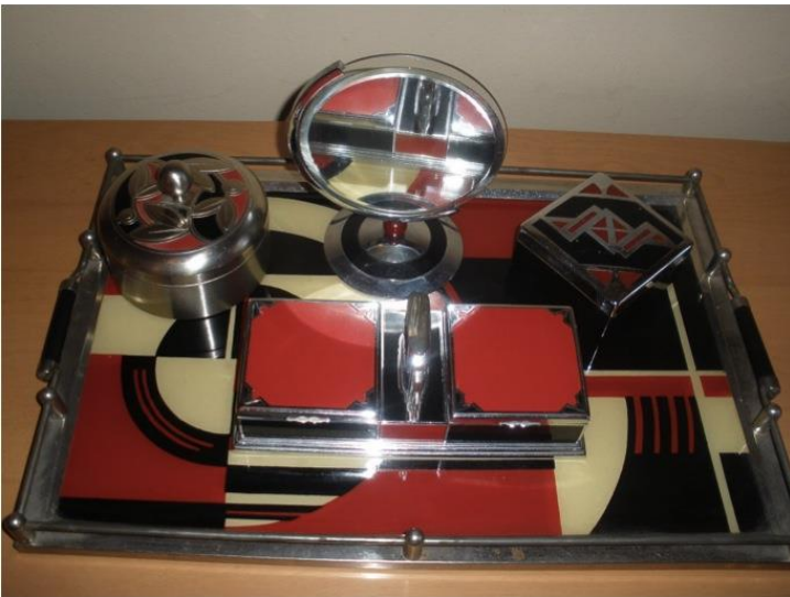
An Art Deco dressing table set