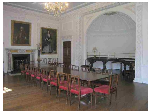
Gillow furniture at Lytham Hall