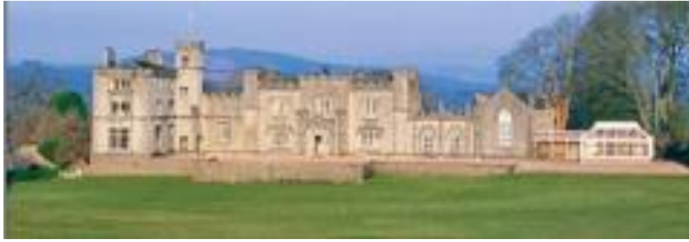
Leighton Hall, Carnforth home of the Gillow Family