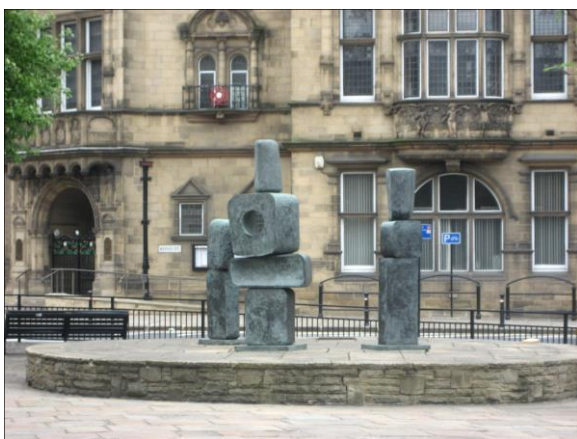
Barbara Hepworth sculptures in her home town of Wakefield