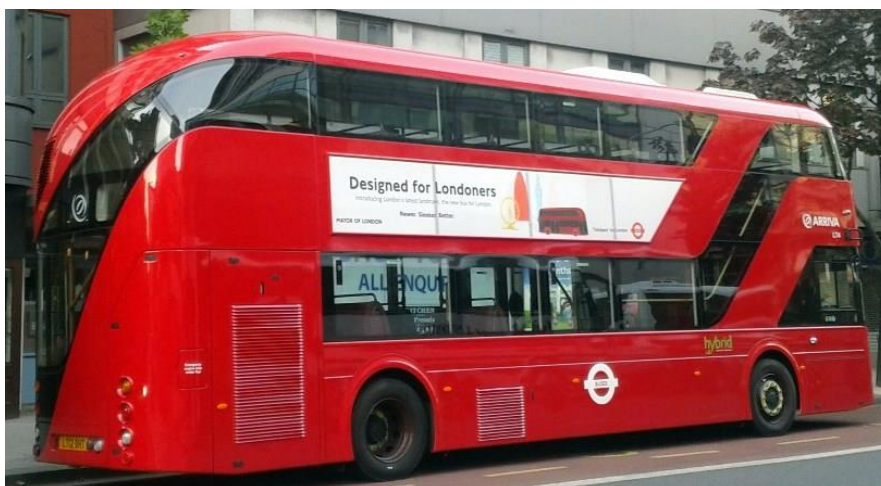
Design for a new London bus, 2010