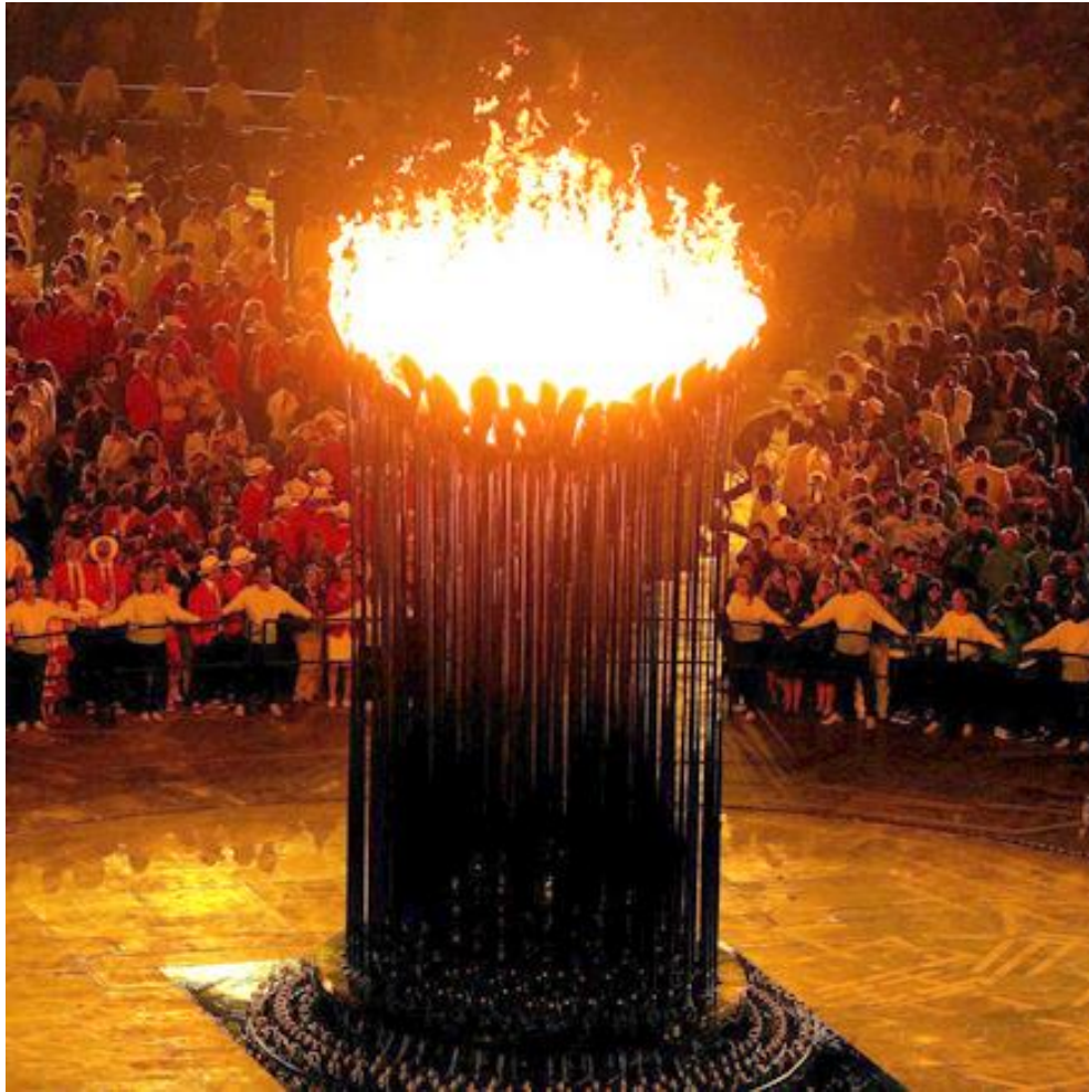
2012 Olympics 'Cauldron'