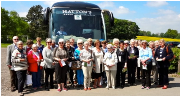
Fylde DFAS members on tour

round the grounds, so we embarked again for a guided tour of Bristol by coach. Val was a most informative guide and we had a comprehensive tour, including walking across the Clifton suspension bridge in the rain.