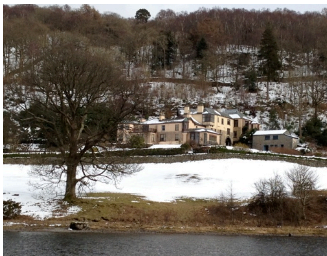
Brantwood viewed from Coniston

The museum is divided into three sections – Ruskin, the Lake District and an extension devoted to the history of Donald Campbell's ultimately fatal pursuit of land and water speed