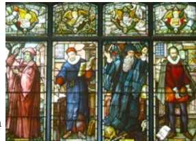
Stained glass at the White Church

The beautiful stained glass windows each tell a story - the Calvary window portrays the