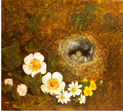
Bird's Nest and Flowers, by M A Ensor

Sadly, many local residents don't realise that this collection exists, and what an amazing asset it is. We hope to change all that. We plan to recruit a team of researchers who can fill the gaps in our knowledge and add interest and colour to the basic facts we have already. The painting shown here is by an