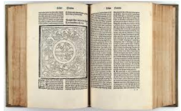
Wynkyn de Worde; 1496

Since the end of the 15th century, when Wynkyn de Worde set up England's first printing press and after 1702, when the first newspaper, the Daily Courant, moved in, the term "Fleet Street" has been synonymous with newspaper journalism. In this lecture we will be looking at the ups and downs of this notorious 'Street of Shame' via the art that illustrated its stories.