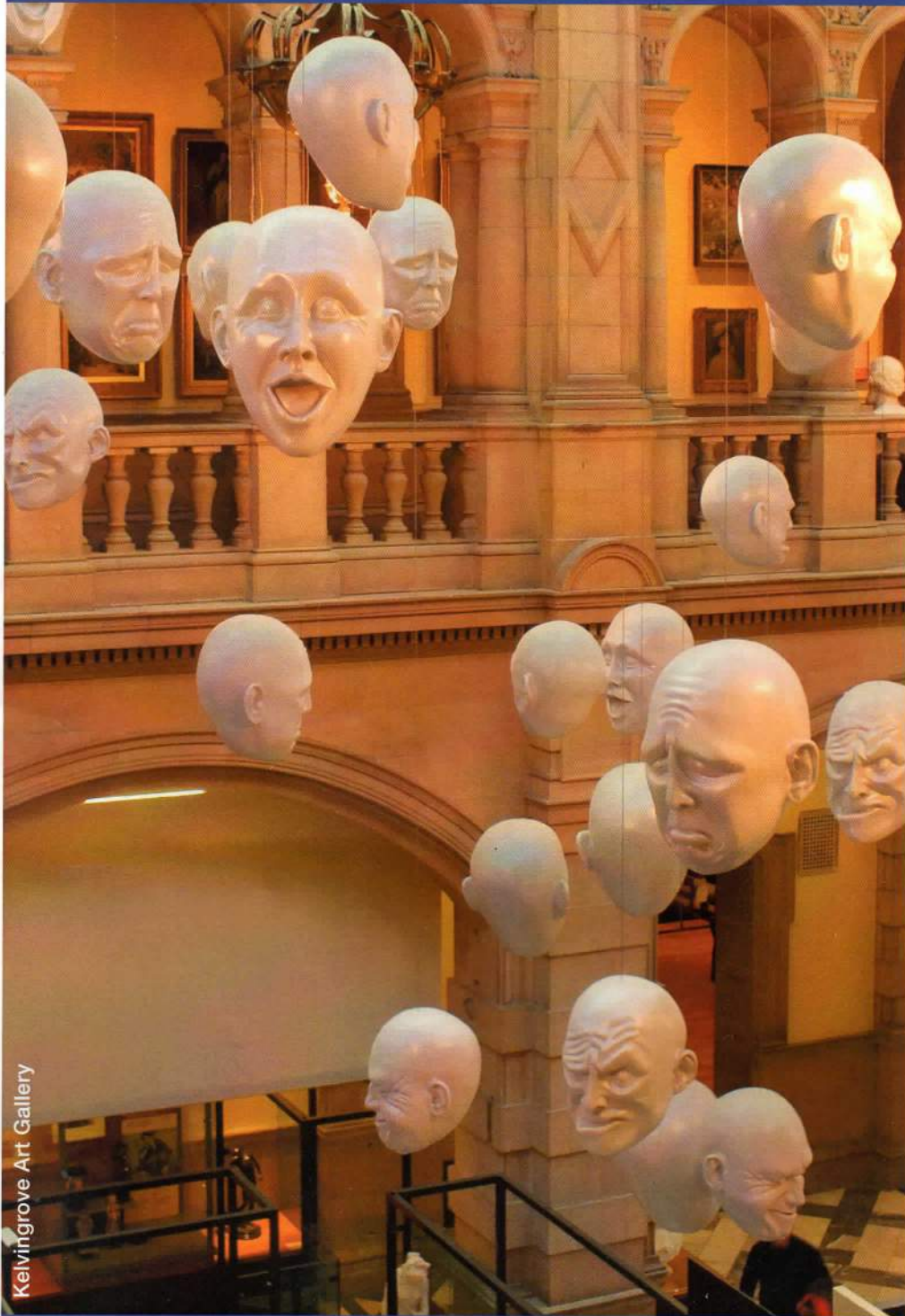
Kelvingrove Art Gallery

Price based on twin share. Minimum numbers required. Normal booking conditions apply.