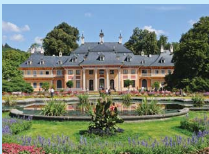
Pillnitz Castle & Gardens