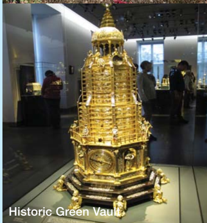
Historic Green Vault