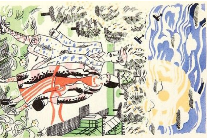
Cover: Piccadilly, 1926; Maurice Greiffenhagen, National Railway Museum

In her first visit to The Arts Society Fylde, Jo Banham aims to conjure up the energy and originality of the decade and to explore the lives of its leading figures with examples of its most innovative art and design.