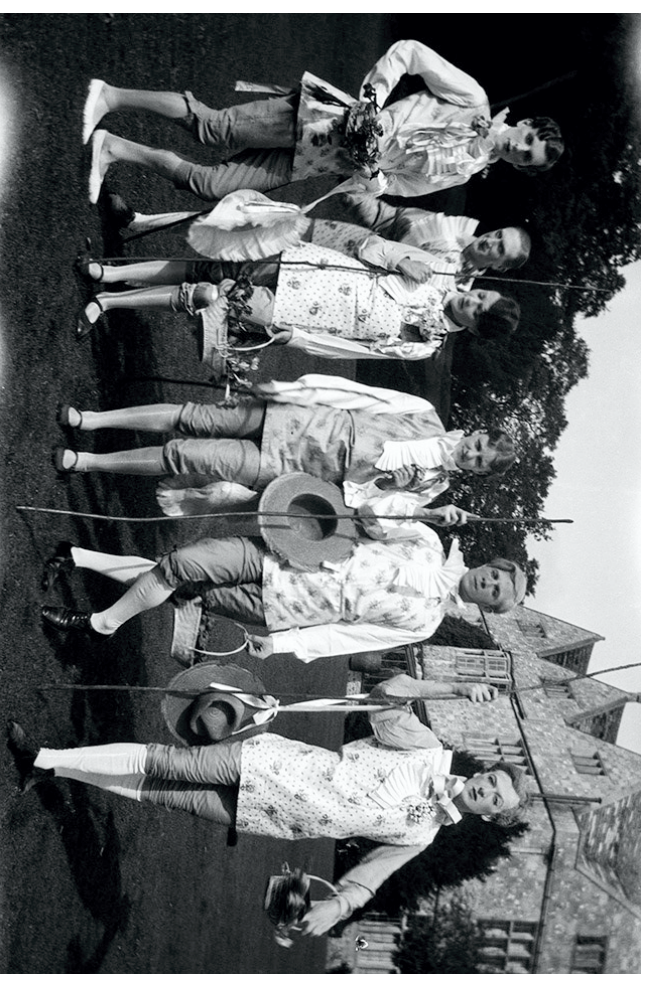
Rex Whistler, Stephen Tennant and others at Wijsden Manor, 1925