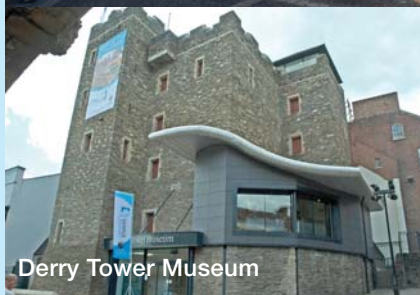
Derry Tower Museum

5 days from £989 Departing 30th May 2024