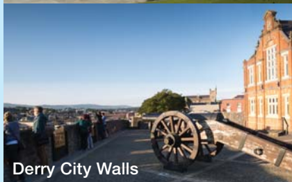
Derry City Walls