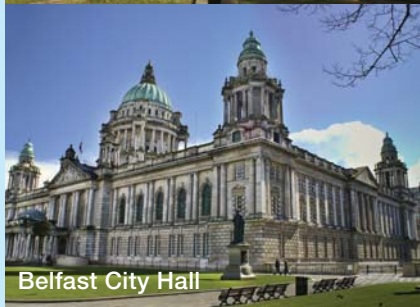
Belfast City Hall