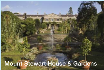
Mount Stewart House & Gardens