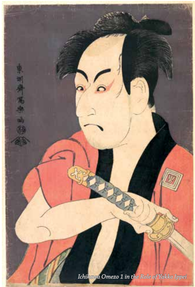
Ichikawa Omezo 1 in the Role of Yakko Ippei

(All the images used in this article were obtained from WikiArt and are in the public domain).