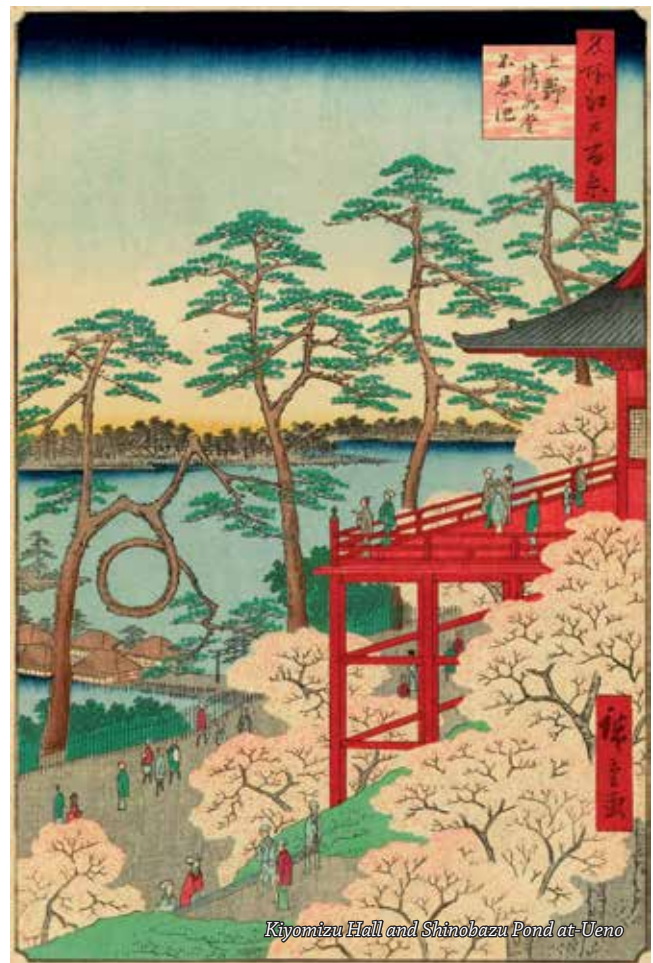
Kiyomizu Hall and Shinobazu Pond at Ueno

These woodblock prints can be broadly categorised as landscapes, flora and fauna, beautiful women, Kabuki theatre and pornography. I've decided to exclude the latter from this article. This first landscape example is Kiyomizu Hall and Shinobazu Pond at Ueno , 1857, from One Hundred Views of Edo by Hiroshige (1797 – 1858), who is perhaps the most well known of the woodblock artists after Hokusai. Landscapes were often produced as a series of views linked by location or on stopping points on long distance routes.