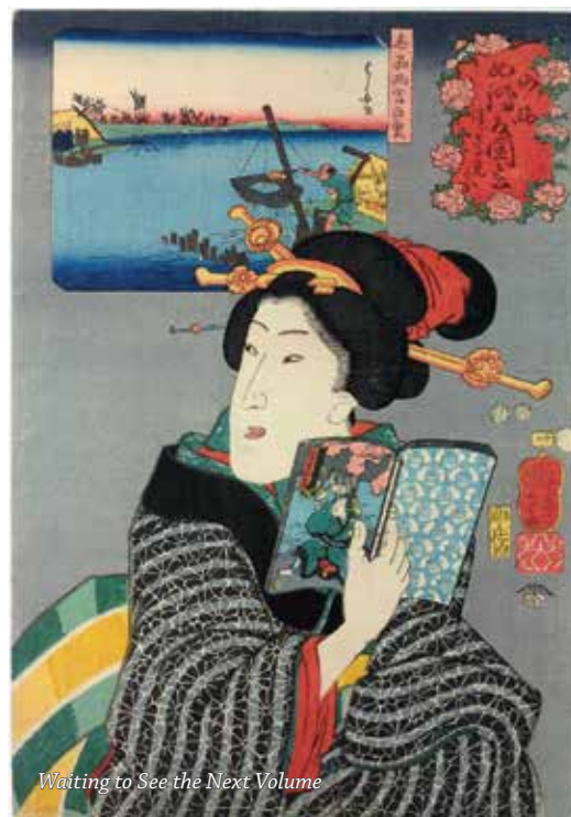
Waiting to See the Next Volume

Waiting to See the Next Volume , 1852, by Utugawa Kuniyoshi is an example of a picture of a beautiful woman. These women were often depicted doing ordinary things, such as reading or washing themselves and were courtesans, geisha girls or noble ladies. The pictures were very popular and epitomized the essence of Ukiyo.