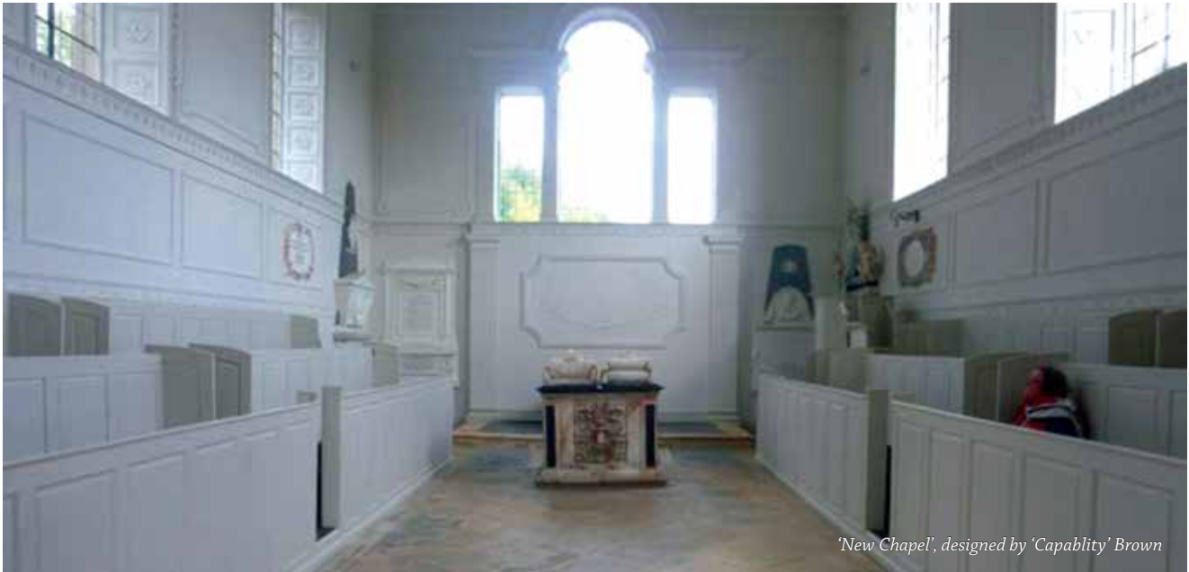
'New Chapel', designed by 'Capability' Brown