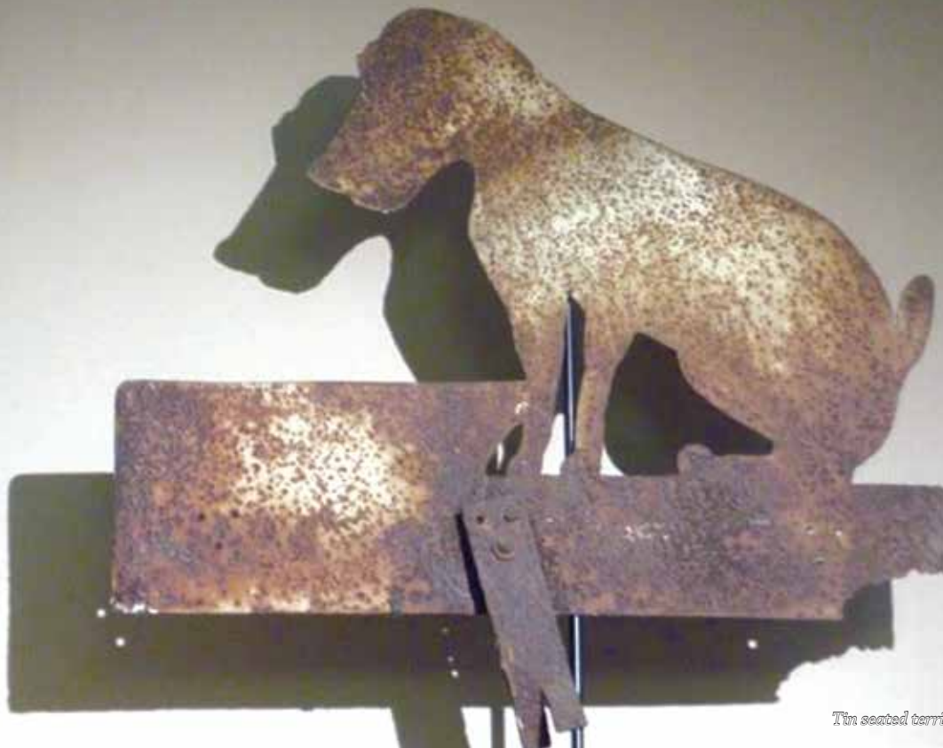
Tin seated terrier dog weathervane