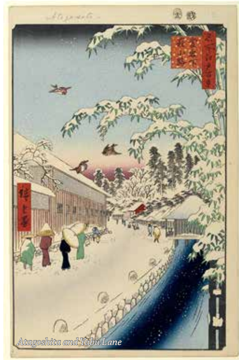
Atagoshita and Yabu Lane

The second landscape here is a snow scene, Atagoshita and Yabu Lane , 1857, also by Hiroshige. Snow scenes were particularly popular and are also very beautiful. In Western European art, single point perspective became predominant from the fifteenth century onwards as a way of depicting three dimensions on a two dimensional surface. This was not generally the case in Japan where multi-point perspective was used to encourage the viewer to travel across the picture. But as Japan started to open up to European trade from the 1850s onward, Japanese artists started to adopt a, to us in the West, more recognisable approach to perspective. This can be seen in this second picture. This opening up of trade also led to the introduction into Japan of Western European pigments and colours, in particular the range of blues available.