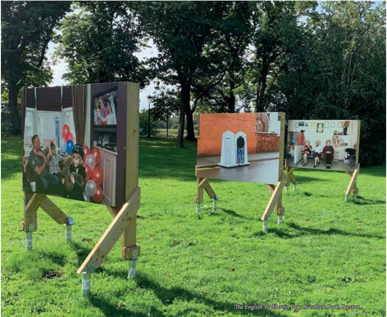
"The English" by Martin Parr, Avenham Park, Preston