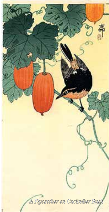
A Flycatcher on Cucumber Bush

Also easily appreciated on the wider world stage are the flora and fauna pictures such as A Flycatcher on a Cucumber Bush , 1910, by Ohara Kosan. This is a good example of the use of negative or empty space, here in the bottom left of the picture, which is a popular technique used to emphasize the main subject matter and common in both Japanese and Chinese art.