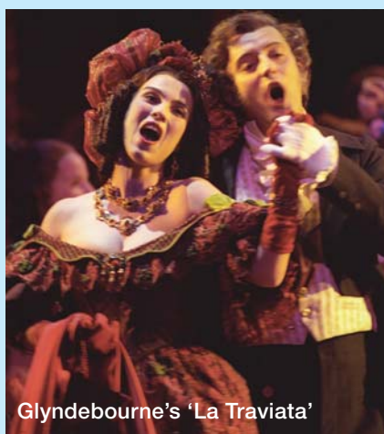
Glyndebourne's 'La Traviata'