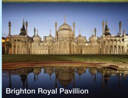
Brighton Royal Pavillion