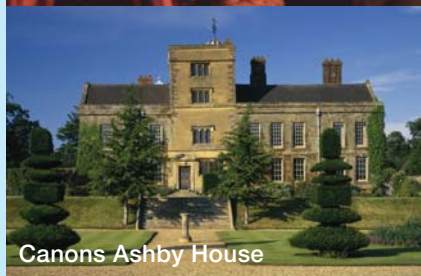
Canons Ashby House