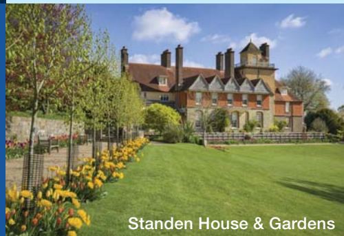
Standen House & Gardens

View and share this tour online - click on View Your Tour at www.tailored-travel.co.uk and quote sald241